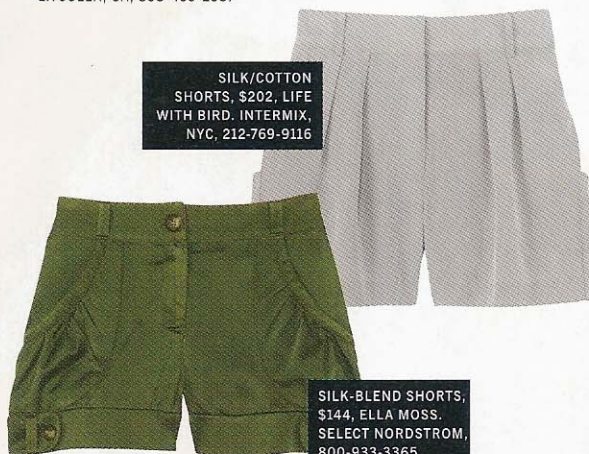
SILK-BLEND SHORTS, $144, ELLA MOSS. SELECT NORDSTROM, 800-933-3365