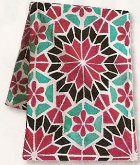
Lands' End towel, $26.50, landsend.com