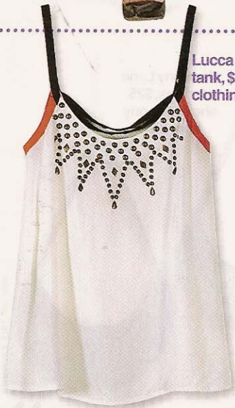
Lucca Couture tank, $49, vertigo clothing.com