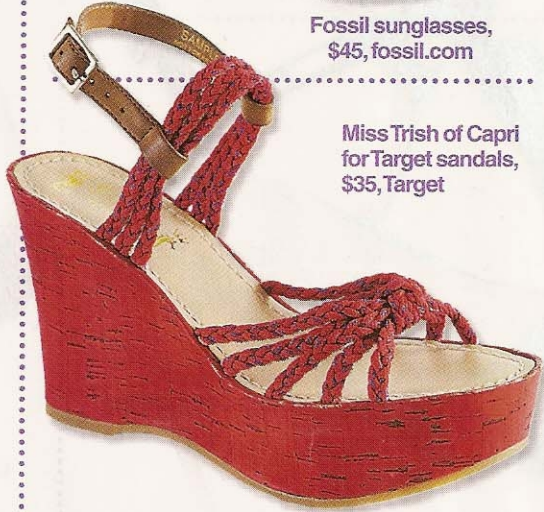
Miss Trish of Capri for Target sandals, $35, Target