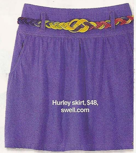
Hurley skirt, $48, swell.com