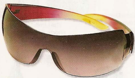
Fossil sunglasses, $45, fossil.com