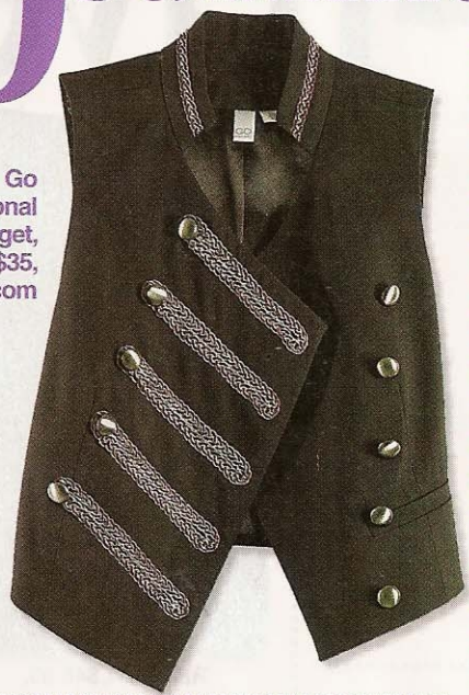
Go International for Target, $35, target.com

KIM KARDASHIAN loves Intermix — a boutique known for expensive brands like Missoni and Zac Posen — but for a day of shopping, she opts for a Balmain-inspired vest from Go International for Target. The price? Only $35!