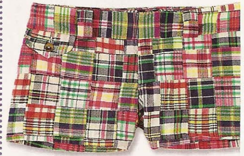
American Eagle Outfitters shorts, $39.50, ae.com