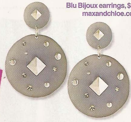
Blu Bijoux earrings, $40, maxandchloe.com