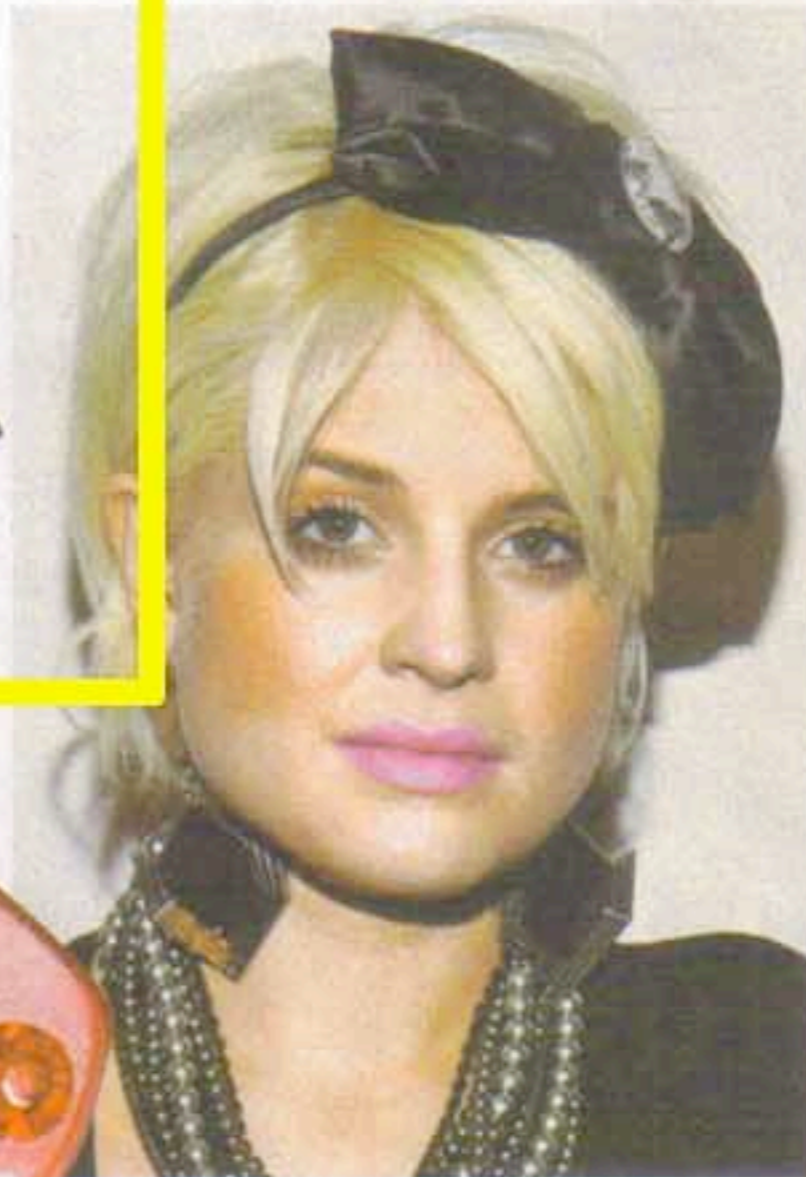
An exaggerated jewel-accented bow headband made all heads turn KELLY OSBOURNE's way.