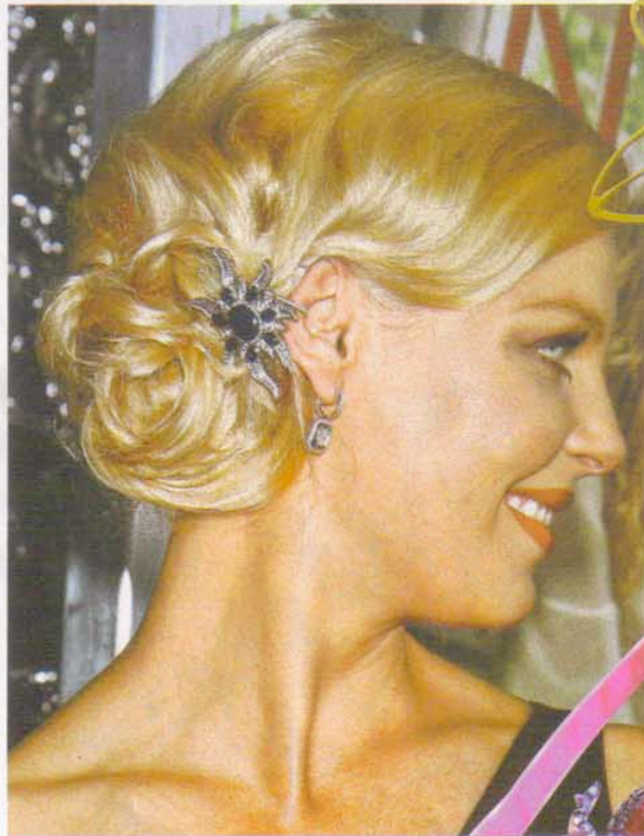
Tucked inside her swirly side chignon, KATHERINE HEIGL's gem-encrusted barrette had a pretty, flirty feel.

1. What could be more feminine than a flower? This one's handmade from stainless steel plated in 14k gold and Lucite. Prismera Woodruff Rose Clip in Aqua & Gold, $60, prismera.com. 2. These glittery pins are perfect for clipping back a bob or pixie. Conair Urban Elegance Bobbies, $6.99, mass retailers. 3. Accent your short cut with a headband featuring handmade oversized pink sequined flowers. True Birds Samantha headband, $38, truebirds.com. 4. Golden topaz and gold beads make this floral barrette a super-sweet choice. Balu Pearl Flower Barrette, $71, hairboutique.com. 5. Whether you wear it as a headband, hippie band, choker or bracelet, this velvet rhinestone and pearl accessory is totally femme. True Birds Gwen headband, $32, truebirds.com.