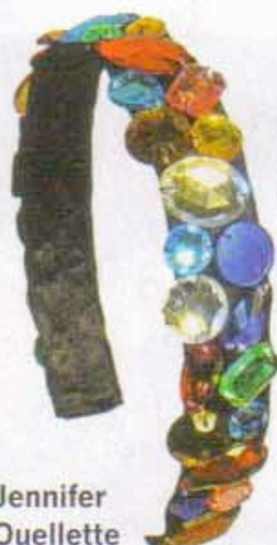
Jennifer Ouellette Gem Covered 1" Satin Band, $155, jenniferouellette.com.