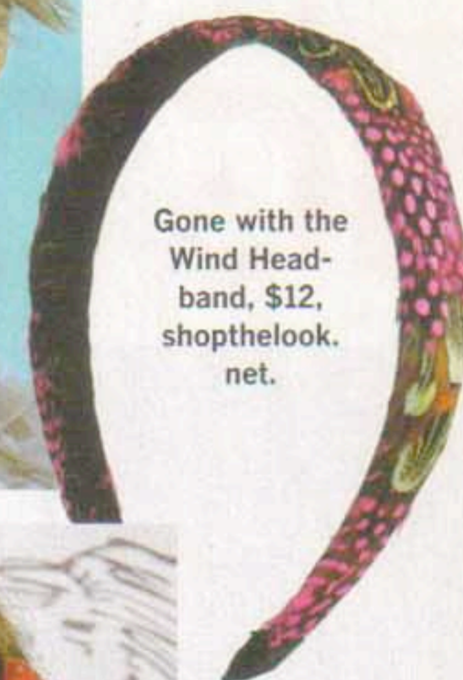
Gone with the Wind Headband, $12, shophthelook.net.