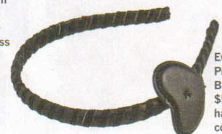
Evita Peroni Prudence Band, $54.38, hairboutique.com.