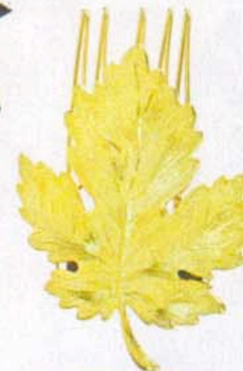
Emily Elizabeth Jewelry Vermont Haircomb, $50, emilyelizabethjewelry.com.