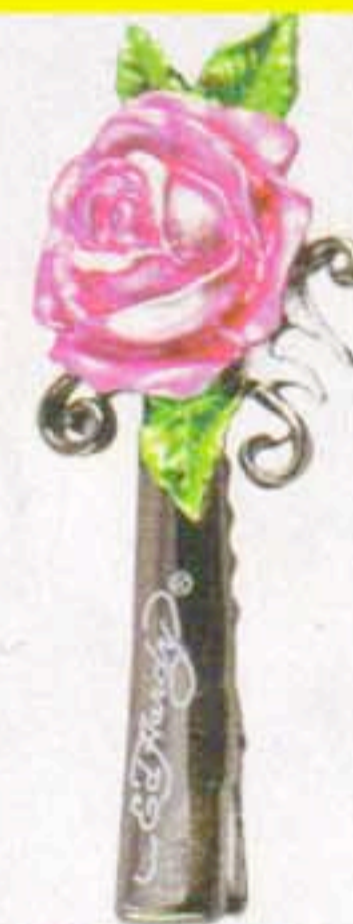
Ed Hardy Rose Clips, $12, folica.com.