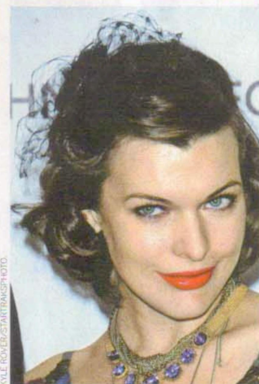
Prismera Branch Rose Clip in Silver/Midnight, $34, prismera.com.