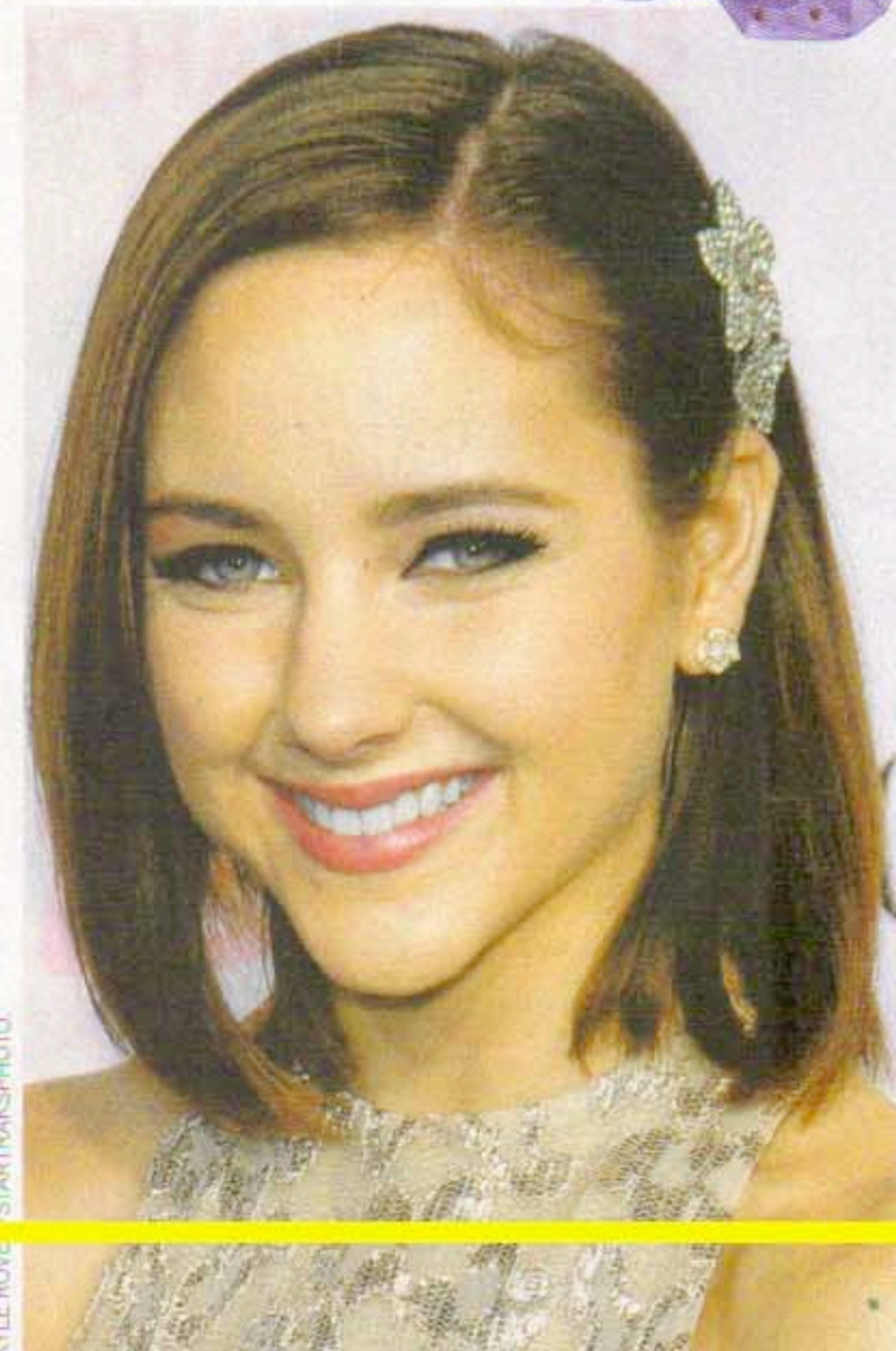
Tai Ribbon Headband with Crystals, $53, hairboutique.com.