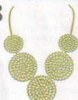
Filigree bib necklace