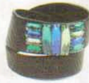
Leather wrap snap