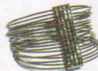
Wired bar bangle