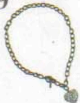
Pave heart pendant