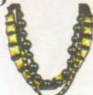
Rocker Tri necklace