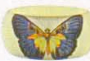
Come Fly With Me bangle