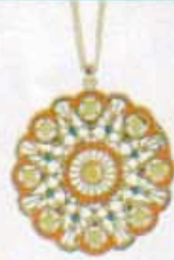
Fancy Filigree necklace