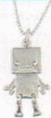
Mini robot necklace