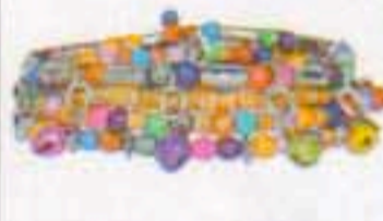
Wood charmie bracelet