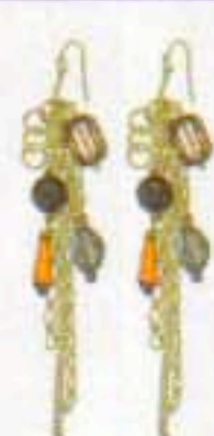
Chain and bead earrings