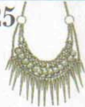
Spike statement necklace