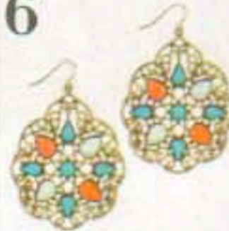
Filigree and teardrop stone earrings