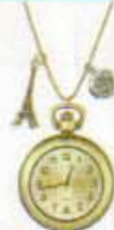
On Paris Time watch necklace