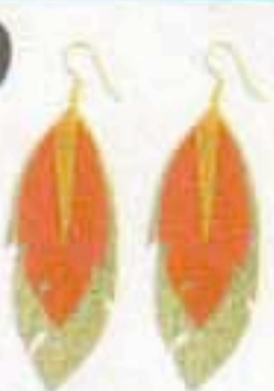
Sequoyah Feather earrings