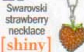
Swarovski strawberry necklace