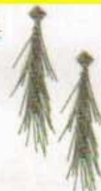
Fringe linear earrings