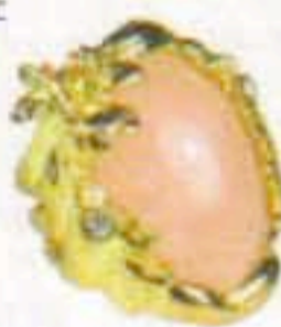
Framed stone ring