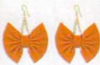
Zoey bow earrings