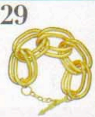
Double link bracelet