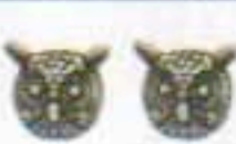
Owl Head studs