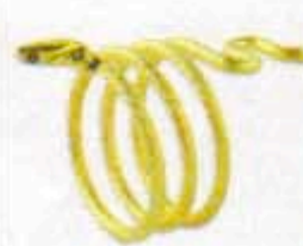
Entwine Just Fine ring