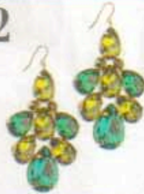
Emerald glamour earrings