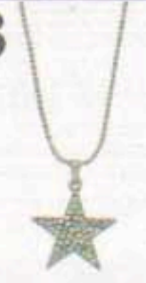
Rhinestone star necklace