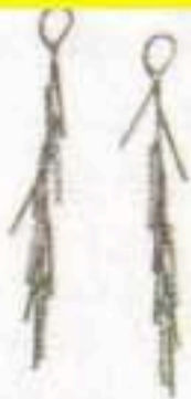
Fringe duster earrings