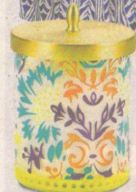
Boho jar, $28, Illumecandles.com