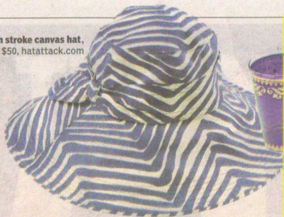
Brush stroke canvas hat, $50, hatattack.com

Get globetrotting style without ever leaving New York City