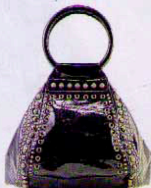
French Connection bag, $120 (originally $168), frenchconnection.com