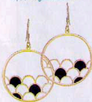
Foxy Originals earrings, $24, foxyoriginals.com