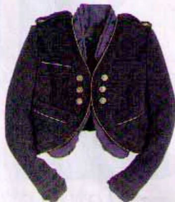
Eryn Brinié jacket, $195, erynbrinie.com