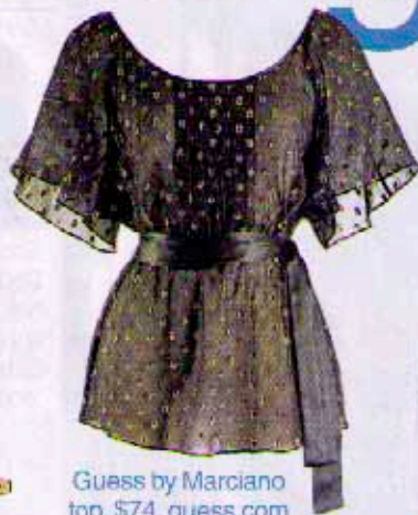
Guess by Marciano top, $74, guess.com