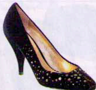
Sigerson Morrison for Target pumps, $37, target.com