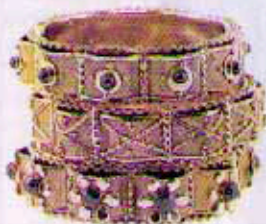
Myrka Dellanos bangles, $60 for three, hsn.com