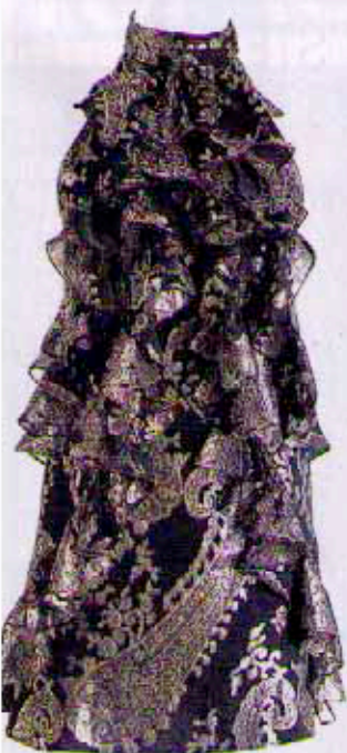
Nu Collective dress, $264, shopblushboutique.com