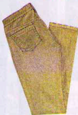
Mango jeans, $79, mangoshop.com