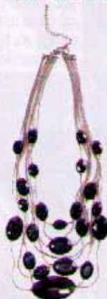
Shophelook.net necklace, $18, shophelook.net