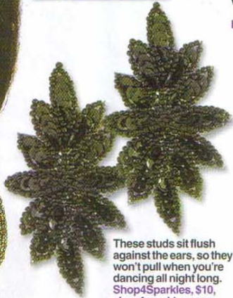
These studs sit flush against the ears, so they won't pull when you're dancing all night long. Shop4Sparkles, $10, shop4sparkles.com

To prevent them from looking chintzy, pair oversized rhinestones with a luxe piece, like a cashmere cardi. Bebe, $24, bebe.com