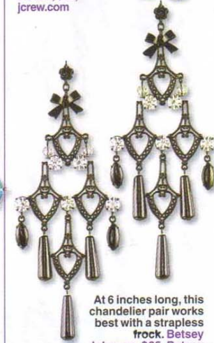
At 6 inches long, this chandelier pair works best with a strapless frock. Betsy Johnson, $65, Betsy Johnson boutiques