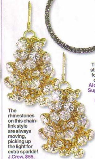
The rhinestones on this chain-link style are always moving, picking up the light for extra sparkle! J.Crew, $55, jcrew.com