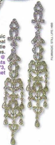
This classic style is ideal for black-tie occasions. Aida Kibur @ Supplements NY, $73, lifemix.net