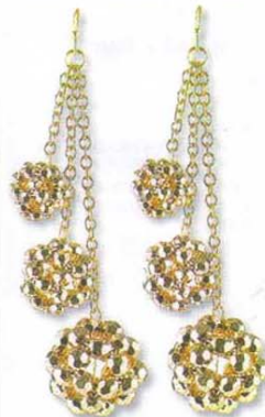
Wear this pair with a black top to highlight the trendy oxidation. Topshop, $45, topshop.com