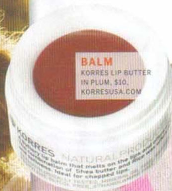
BALM KORRES LIP BUTTER IN PLUM, $10, KORRESUSA.COM