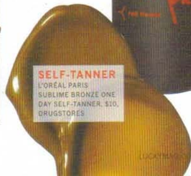
SELF-TANNER L'ORÉAL PARIS SUBLIME BRONZE ONE DAY SELF-TANNER, $10, DRUGSTORES