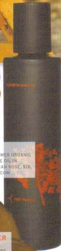
OIL RED FLOWER ORGANIC MASSAGE OIL IN MOROCCAN ROSE, $18, BEAUTY.COM