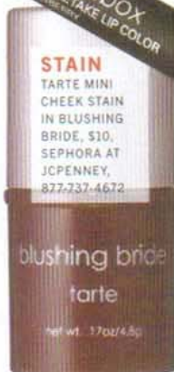
STAIN TARTE MINI CHEEK STAIN IN BLUSHING BRIDE, $10, SEPHORA AT JCPENNEY, 877-237-4672