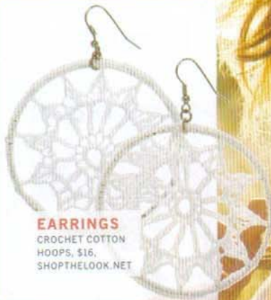
EARRINGS CROCHET COTTON HOOPS, $16, SHOPTHELOOK.NET