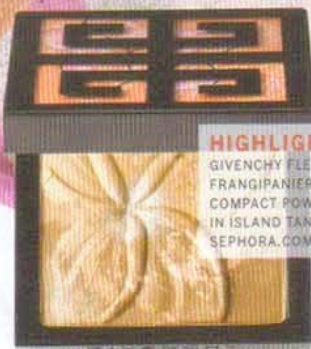
HIGHLIGHTER GIVENCHY FLEUR DE FRANGIPANIER UNIQUE COMPACT POWDER IN ISLAND TAN, $45, SEPHORA.COM