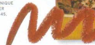
PENCIL SMASHBOX DOUBLETAKE LIP COLOR IN CRANBERRY, $22, NORDSTROM.COM