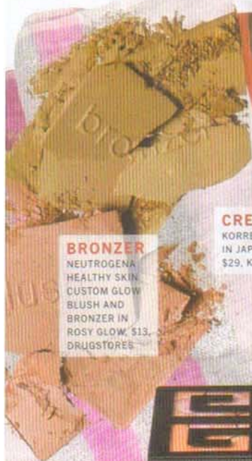
BRONZER NEUTROGENA HEALTHY SKIN CUSTOM GLOW BLUSH AND BRONZER IN ROSY GLOW, $13, DRUGSTORES