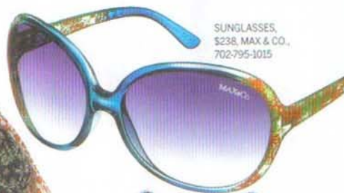
SUNGLASSES, $238, MAX & CO., 702-795-1015