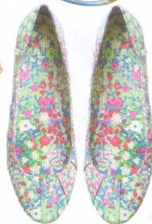
ORGANIC COTTON FLATS, $15, H&M, HML.COM FOR LOCATIONS