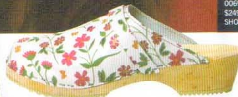
LEATHER "FLORAL GARDEN" CLOGS, $96, CAPE CLOGS, ENDLESS.COM