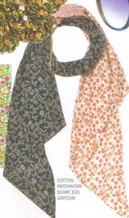
COTTON PATCHWORK SCARF, $30, GAP.COM