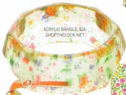
ACRYLIC BANGLE, $14, SHOPTHELOOK.NET