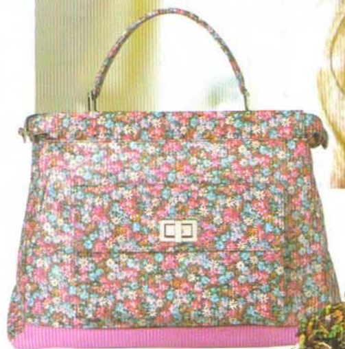
LEATHER TOTE, $595, REBECCATAYLOR.COM

COTTON CLOCHE, $100, A.P.C., 212-966-0069. MINIDRESS, $249, BARLOW, SHOPBOP.COM