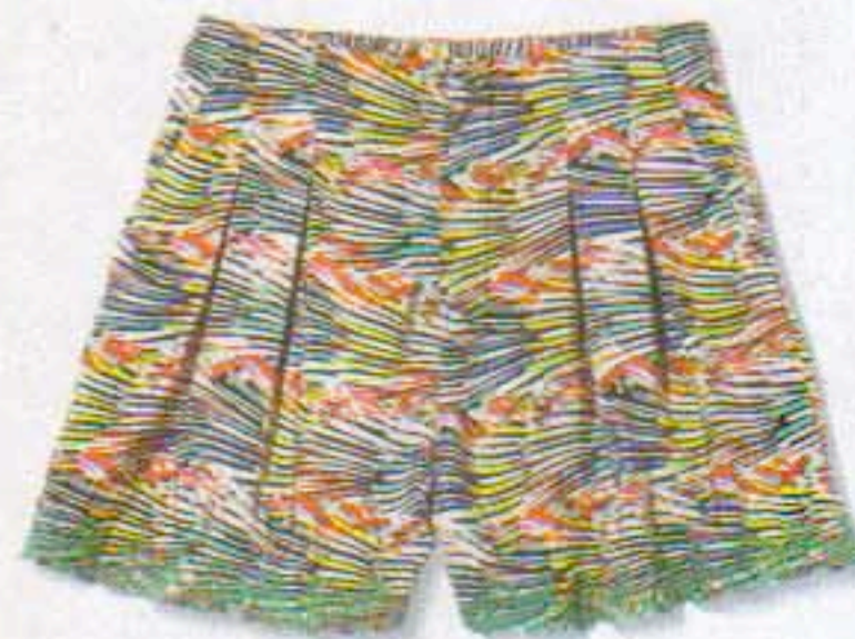
• Shorts, Gracia , $49