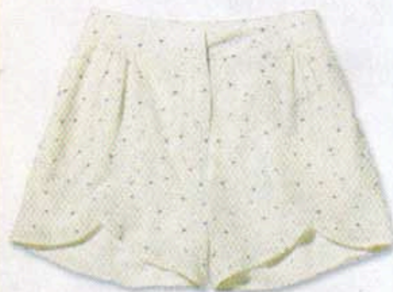
• Shorts, Funktional , $91

Top, Bebe , $79. Shorts, Forever 21 , $16. Shoes, Steve Madden , $99. Earrings, ShoptheLook.net , $12. Bracelet, Kenneth Jay Lane for Avon , $60.