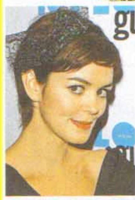
NORA ZEHETNER