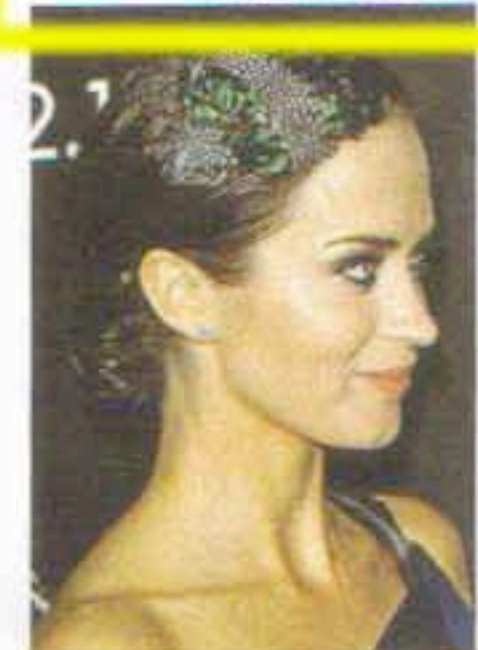
EMILY BLUNT