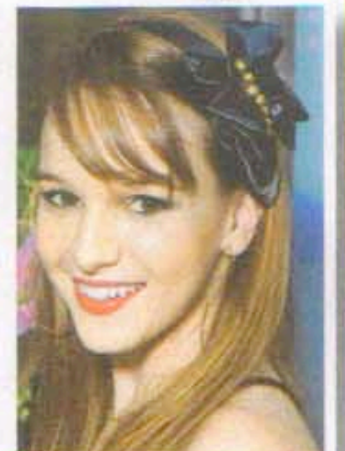
KAY PANABAKER