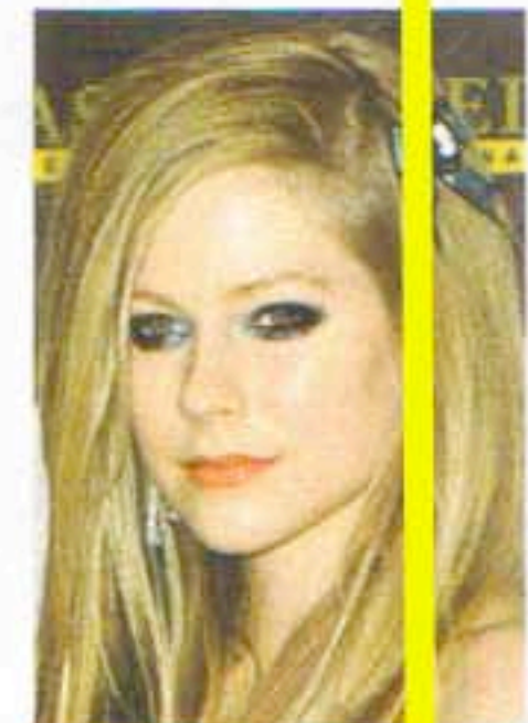
AVRIL LAVIGNE

Bows are turning up everywhere this season. You'll find them on headbands and on their own, in all different sizes.