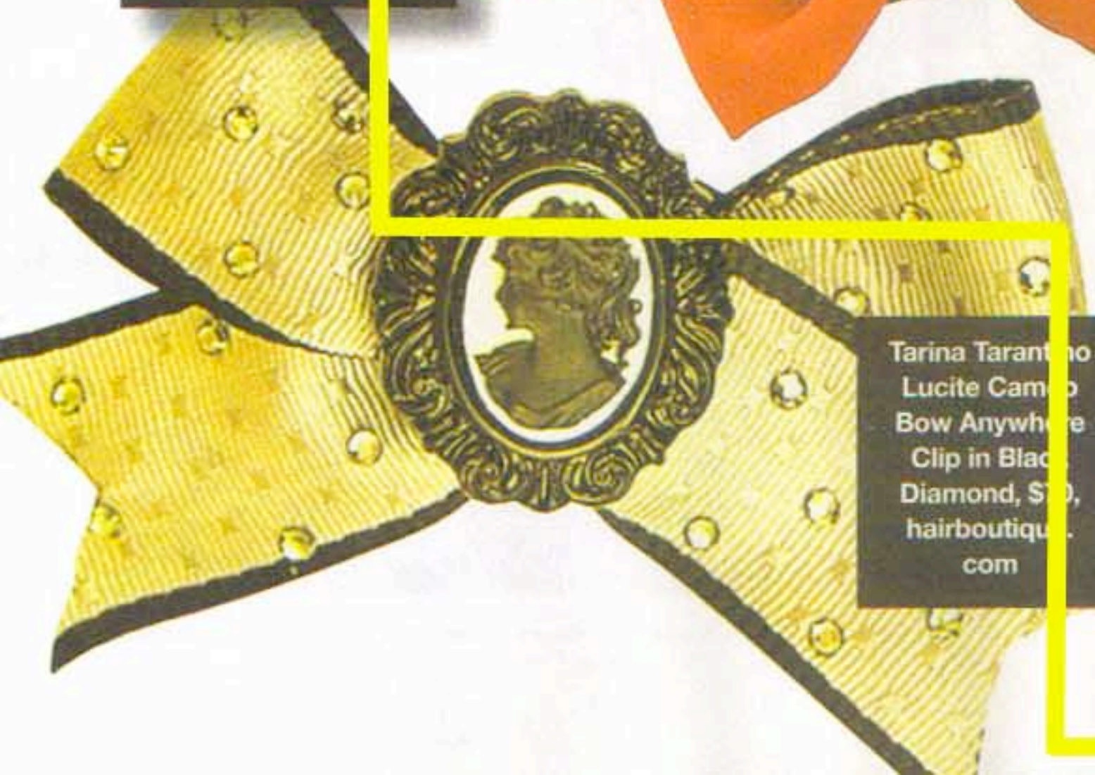
Tarina Tarantino Lucite Cameo Bow Anywhere Clip in Black Diamond, $20, hairboutique.com