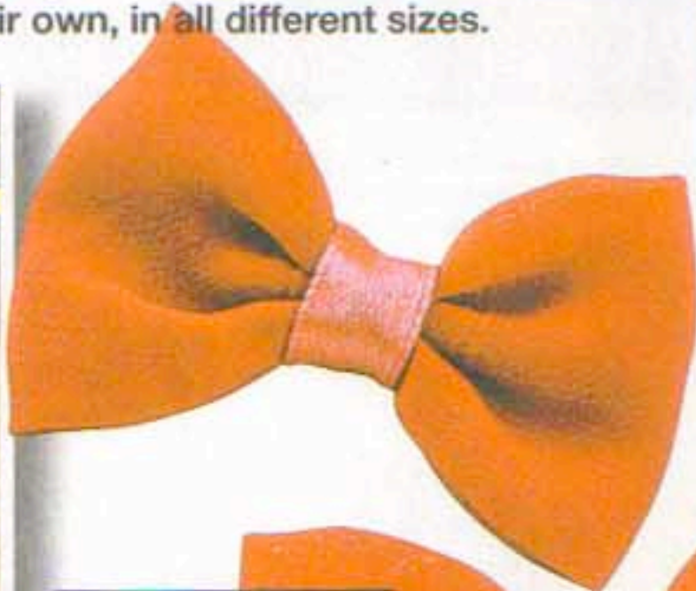
Love Bow Barrettes, $10, shopthelook.net