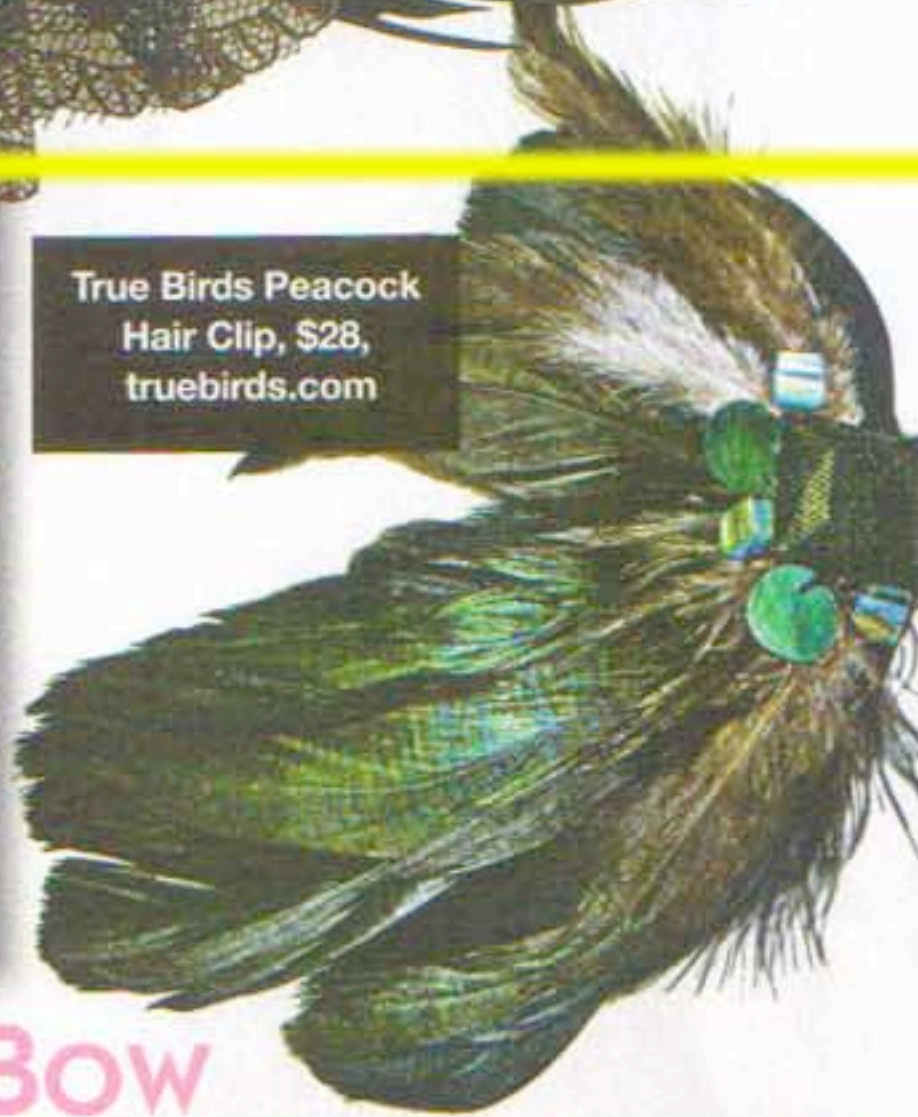
True Birds Peacock Hair Clip, $28, truebirds.com