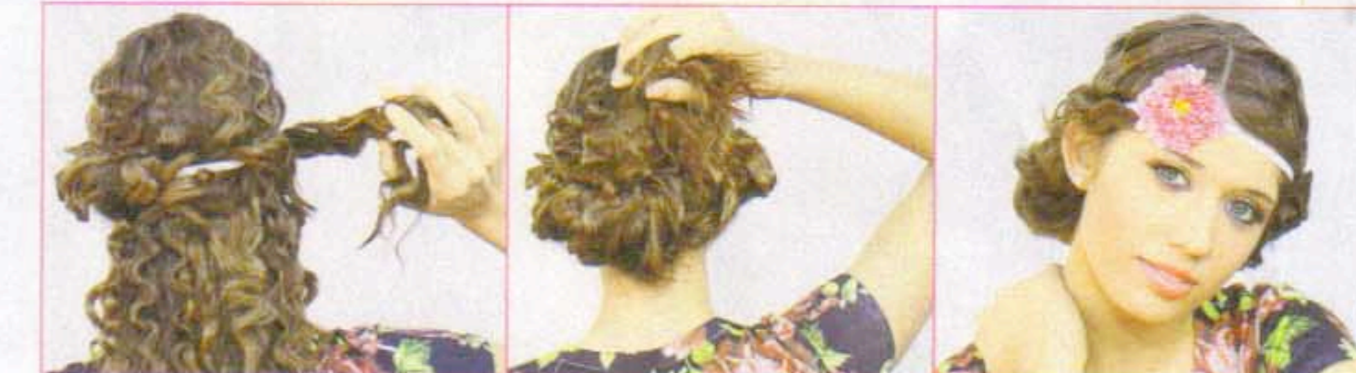
TO DO: Place the band across the forehead and weave hair through the elastic. Continue rolling and tucking hair until it feels secure, tuck loose ends in place and you're good to go!