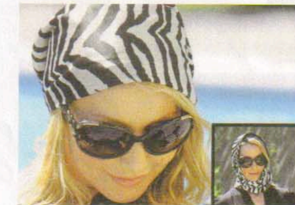
Pop-in-Go designer scarves protect your hair from the elements and have a cool, Nicole Richie-inspired look; available in a variety of styles and shown here in Zebra, starting at $19.99 at buypopngo.com.