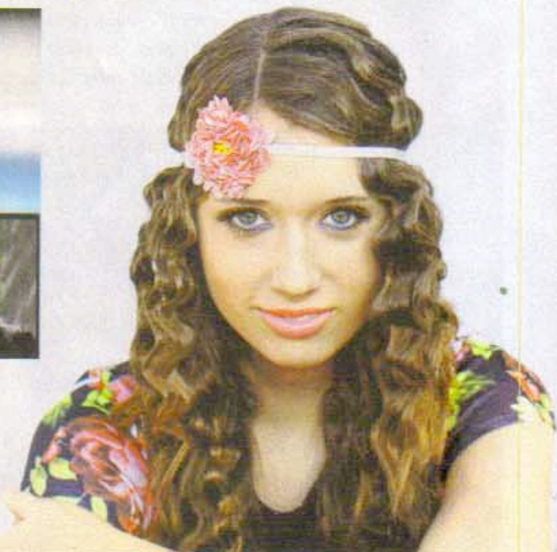
Whether you've opted for a half updo or are wearing your hair all up, this headband with floral accent sets it off to perfection, especially when hair has lots of natural bend. The Selma Twist Band is made of matte sequins and beads on an adjustable band; available in coral, turquoise, cream, black, red, gold and silver; shown here in yellow; $28 at Nordstrom locations and Truebirds.com.