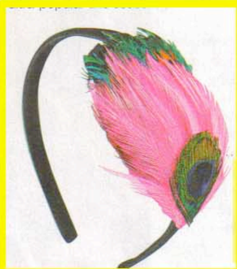
This brightly colored Peacock feather sitting on a narrow black headband is $14 at shopthelook.net.