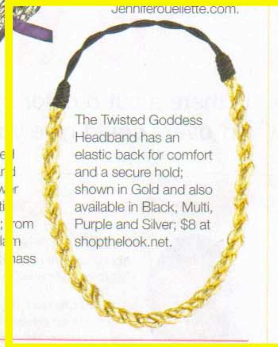
The Twisted Goddess Headband has an elastic back for comfort and a secure hold; shown in Gold and also available in Black, Multi, Purple and Silver; $8 at shopthelook.net.