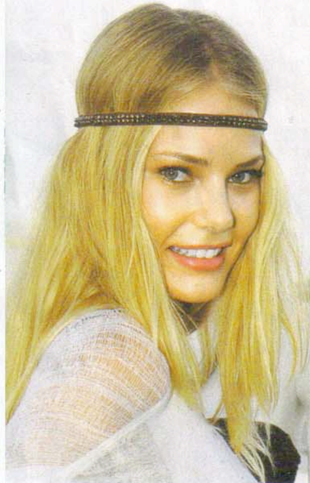
Model Tori Praver hits Miami Swim Week in a narrow elastic headwrap worn way down low.

If you like all things Boho, try one of these hippie-inspired looks.