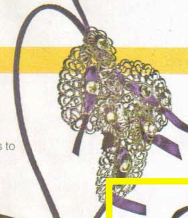
Add dazzle to your 'do with this Metal Lace Headpiece with satin ribbon and stones, available in 45 colors and shown in Purple; $135 at Jenniferouellette.com.