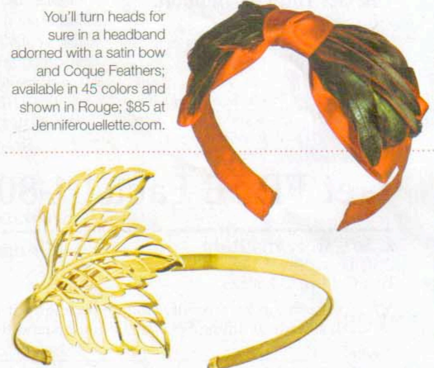
You'll turn heads for sure in a headband adorned with a satin bow and Coque Feathers; available in 45 colors and shown in Rouge; $85 at Jenniferouellette.com.